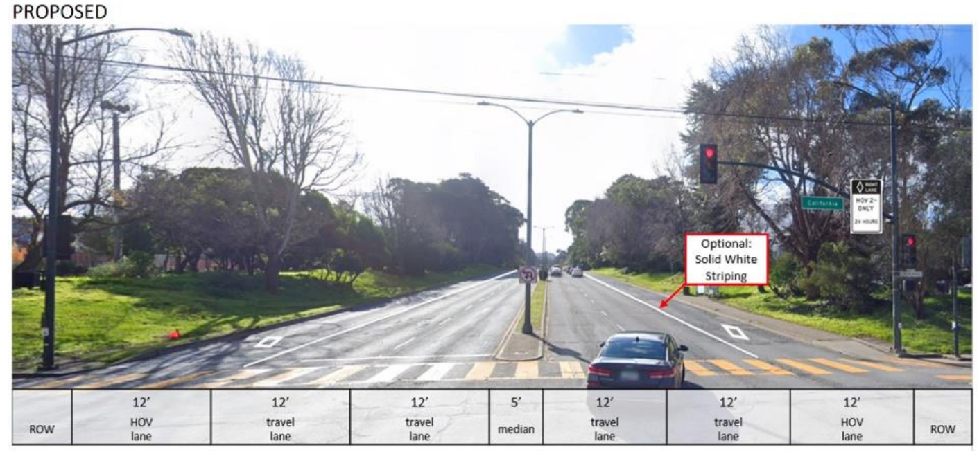
Figure 3: Cross Section Views of Existing and Proposed Conditions on Park Presidio at California